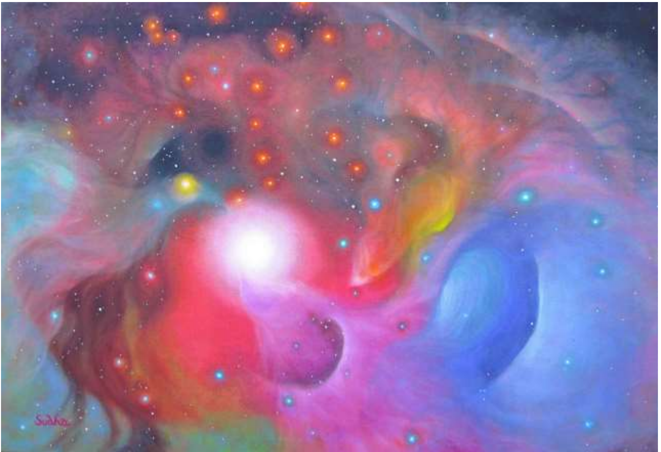
Figure 6. Phoenix Nebu Sphere. 2011. oil on canvas. 80 x 100 cm. Sudha Daniel.