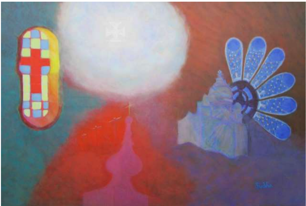
Figure1. Homage to Viana do Castelo. 2008. oil on canvas. 80 x120 cm. Sudha Daniel.