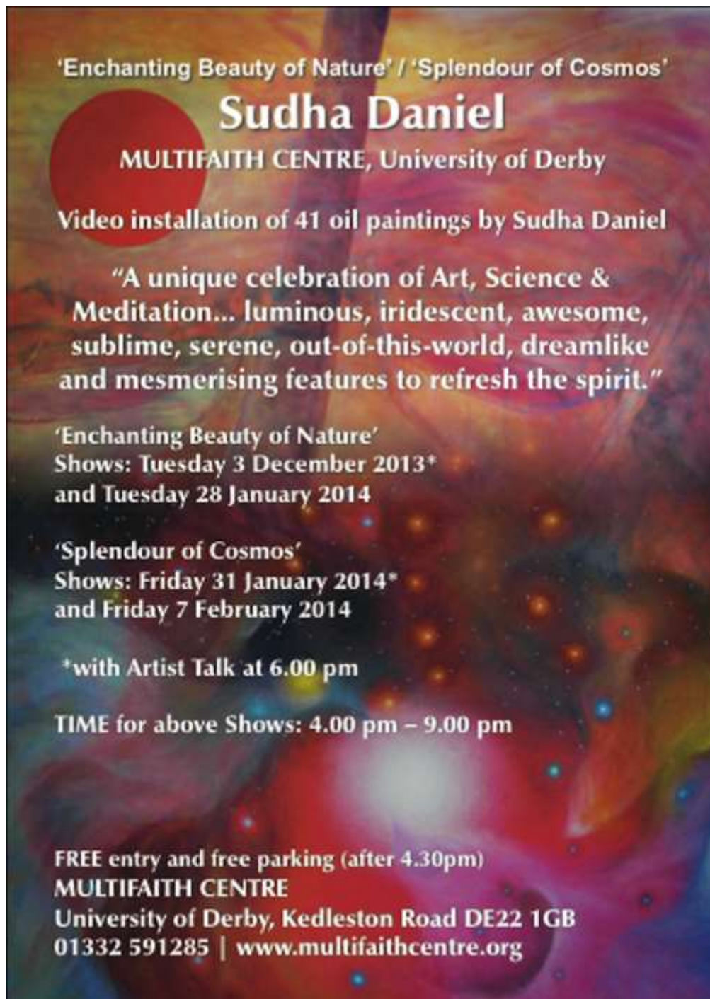
Figure 10. Exhibition Poster Image, at Multi-Faith Centre, University of Derby. 2013. Sudha Daniel. Copyright: Courtesy of the Artist.