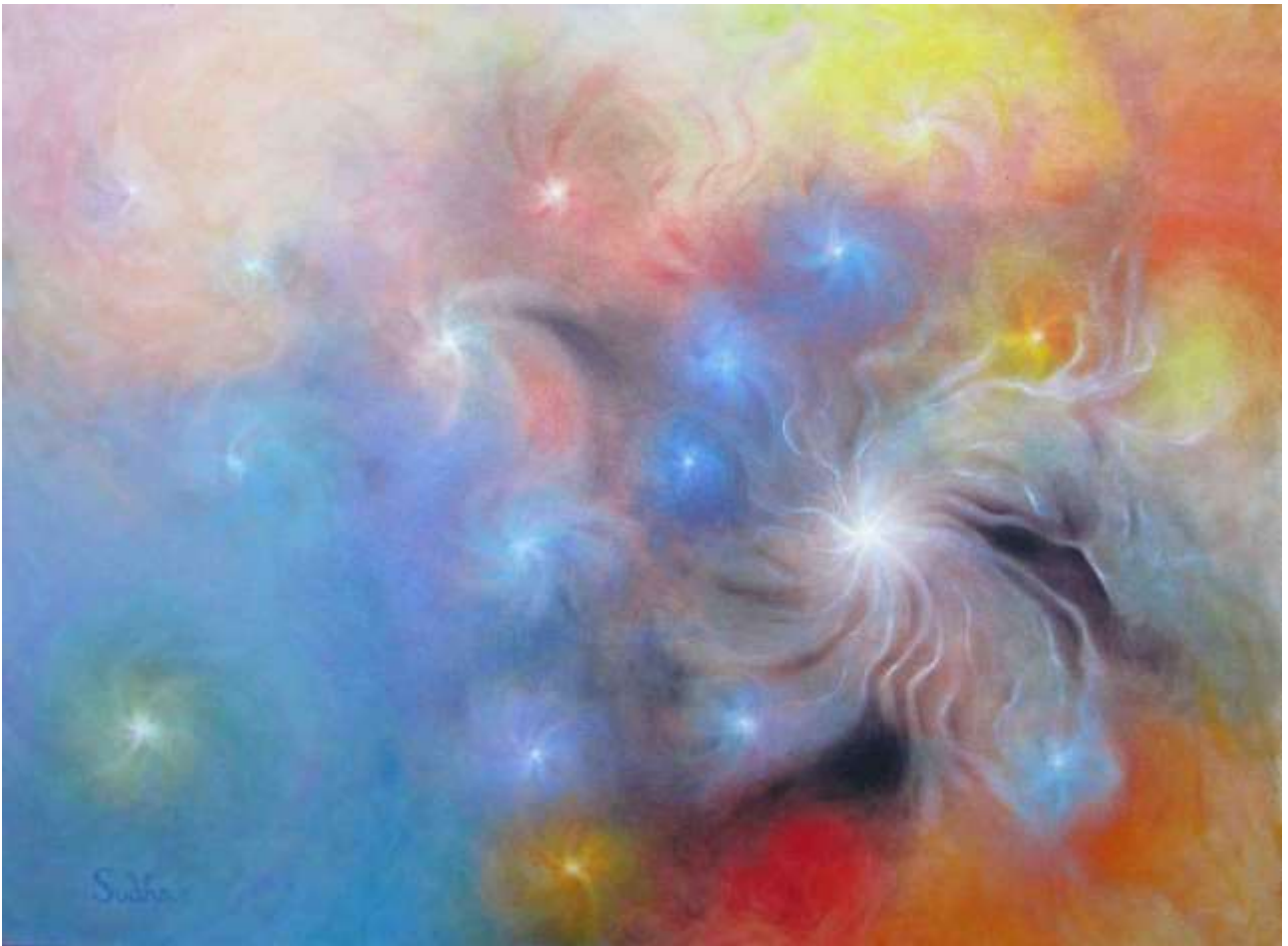
Figure 7. Evolving Nebular Stars. 2012. oil on canvas. 80 x 100 cm. Sudha Daniel. Copyright: Courtesy of the Artist.