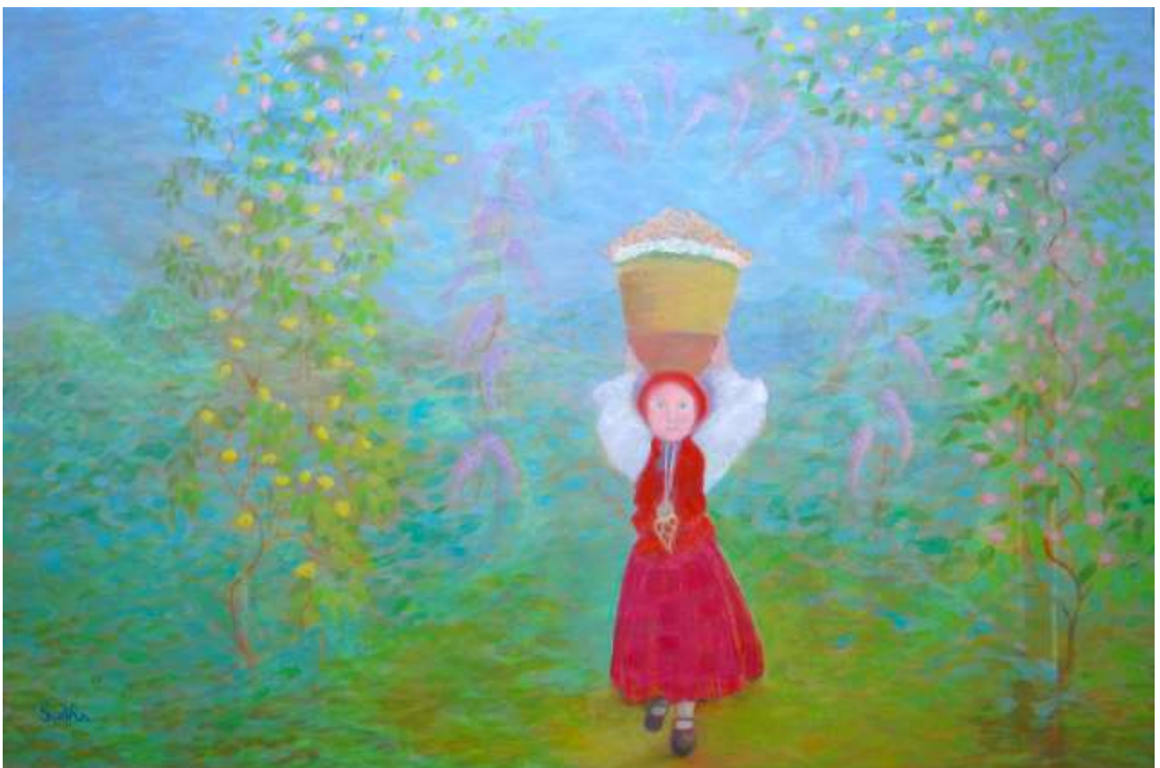
Figure 3. Spring Flower Girl, Portugal. oil on canvas. 2009. 80 x120 cm. Sudha Daniel.