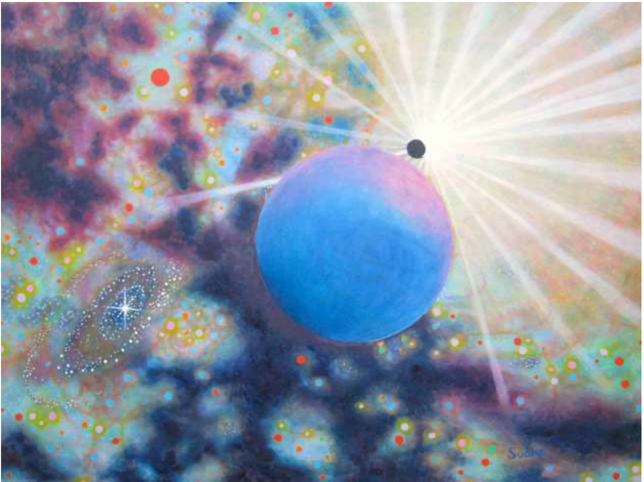
Figure 8. Cosmos Storm and Calm. 2013. oil on canvas. 110 x 155 cm. Sudha Daniel.