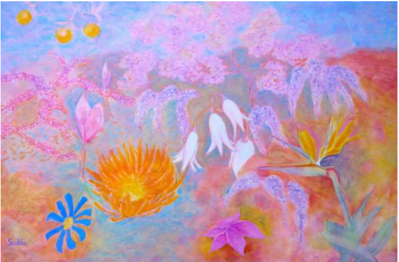
Figure 2. Beauty of Viana Spring. oil on canvas. 2008. 80 x120 cm. Sudha Daniel. Copyright: Courtesy of the Artist.