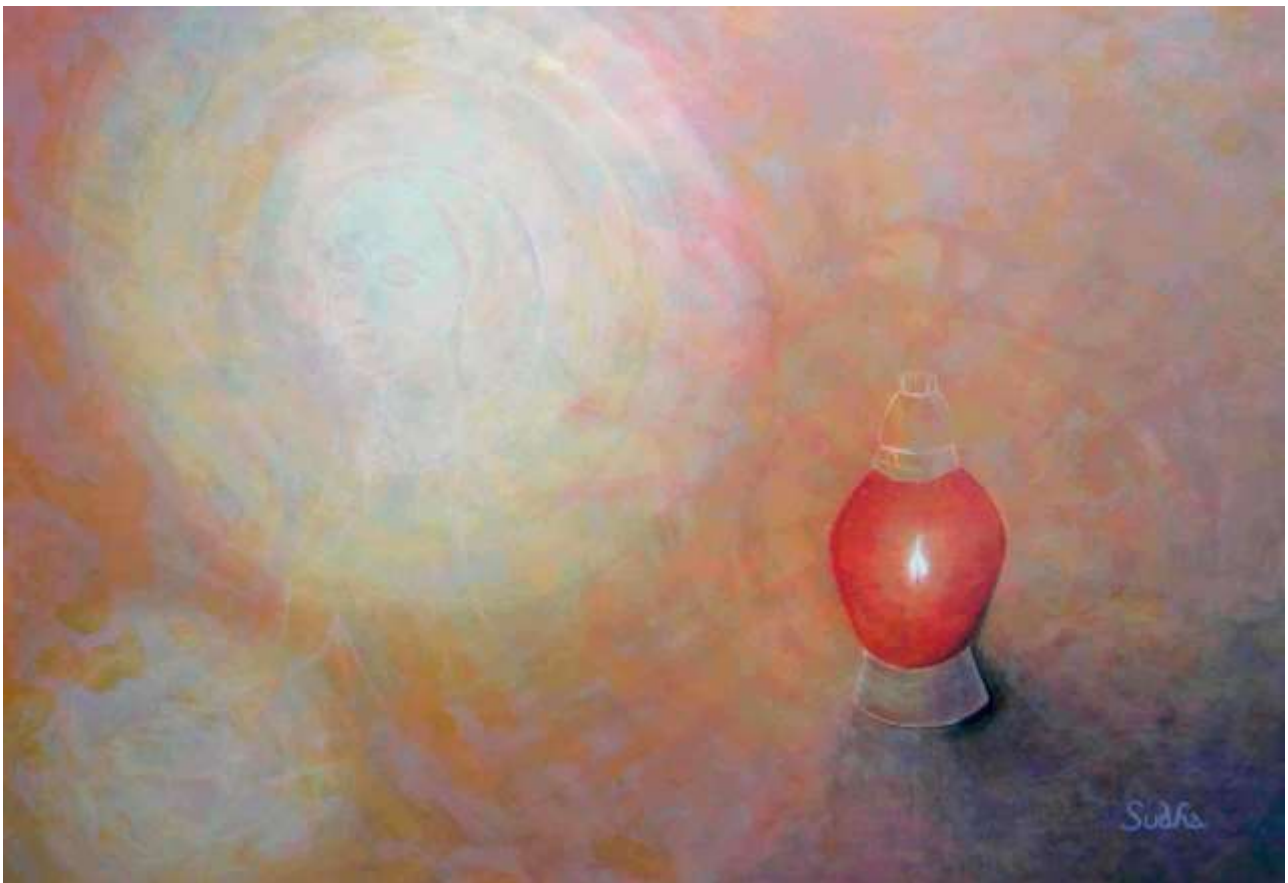
Figure 4. Blessing of Santa Maria. oil on canvas. 2009. 80 x120 cm. Sudha Daniel. Copyright: Courtesy of the Artist.